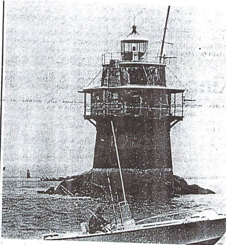
Bug Light — 1978

This photo of the Bug Light was taken during the summer of 1978